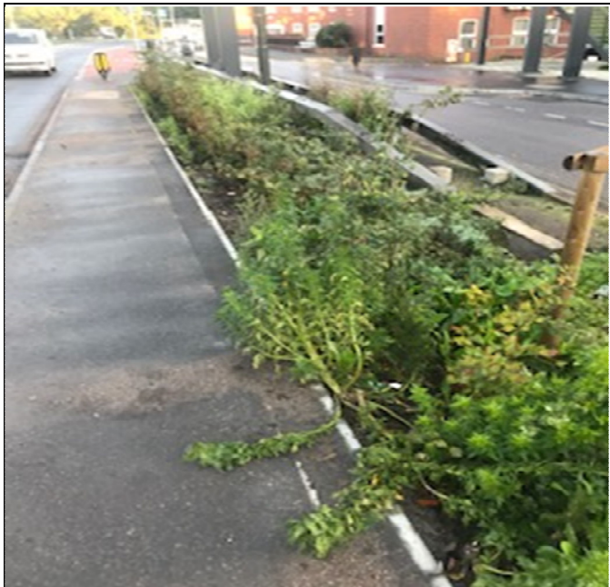
The weeds coming through again in the beds by Gateway 1.