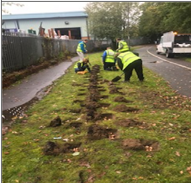
The volunteers working hard along Magpie Walk and by the Terrace.