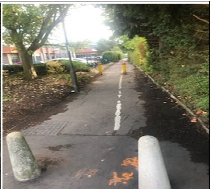
Before and after of the subway by Woolborough Lane. Trying to keep this clean for the cyclists.