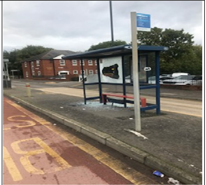
There was a spate of vandalism where various bus stops and vehicles were damaged.